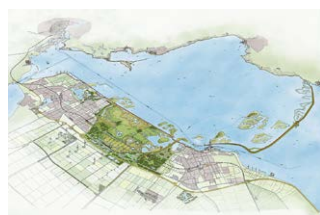
Nationaal Park Nieuw Land, NL Size: 29,000 ha Year: 2018-2019