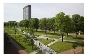
Delft University of Technology campus, Delft, NL Size: 10 ha Year: 2004-2009