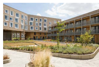
Key Worker Housing, University of Cambridge, UK Size: 22,718 m 2 Year: 2012-2018