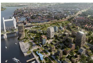
Ontwikkelingsvisie Spoorzone, Dordrecht, NL Year: 2020