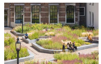
Hoogheemraadschap, Delft, NL Size: 8,800 m 2 Year: 2014-2017