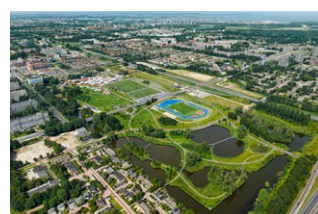
Nelson Mandela Park, Amsterdam, NL Size: 413,000 m 2 Year: 2003-2011